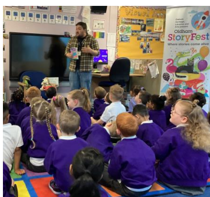
Some Mayfield Magic Moments