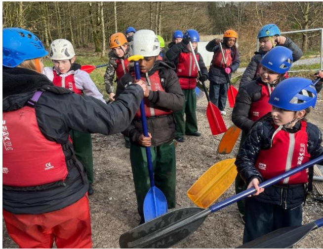
Year Six children took part in a wide range of adventure and team-building activities.