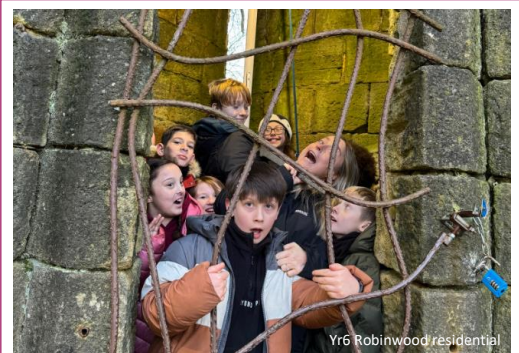
Yr6 Robinwood residential

At Mayfield we talk to our children about the value 'Love of All'.